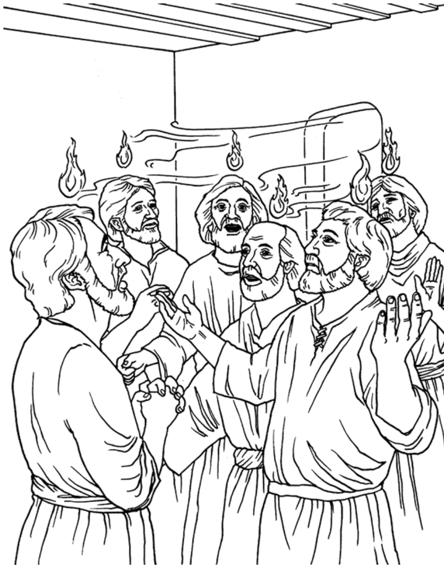
The Day of Pentecost Acts 2